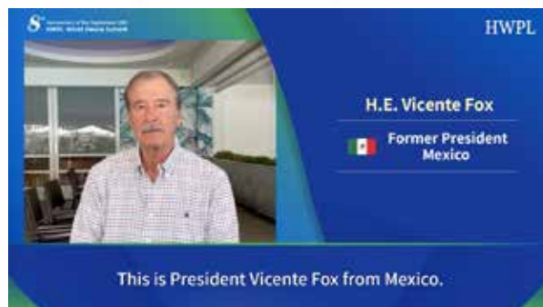
H.E. Vicente Fox