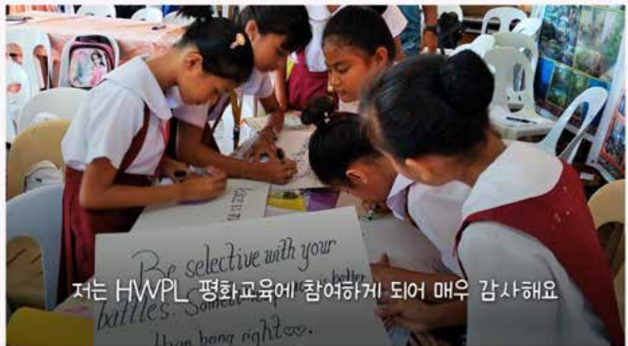
저는 HWPL 평화교육에 참여하게 되어 매우 감사해요