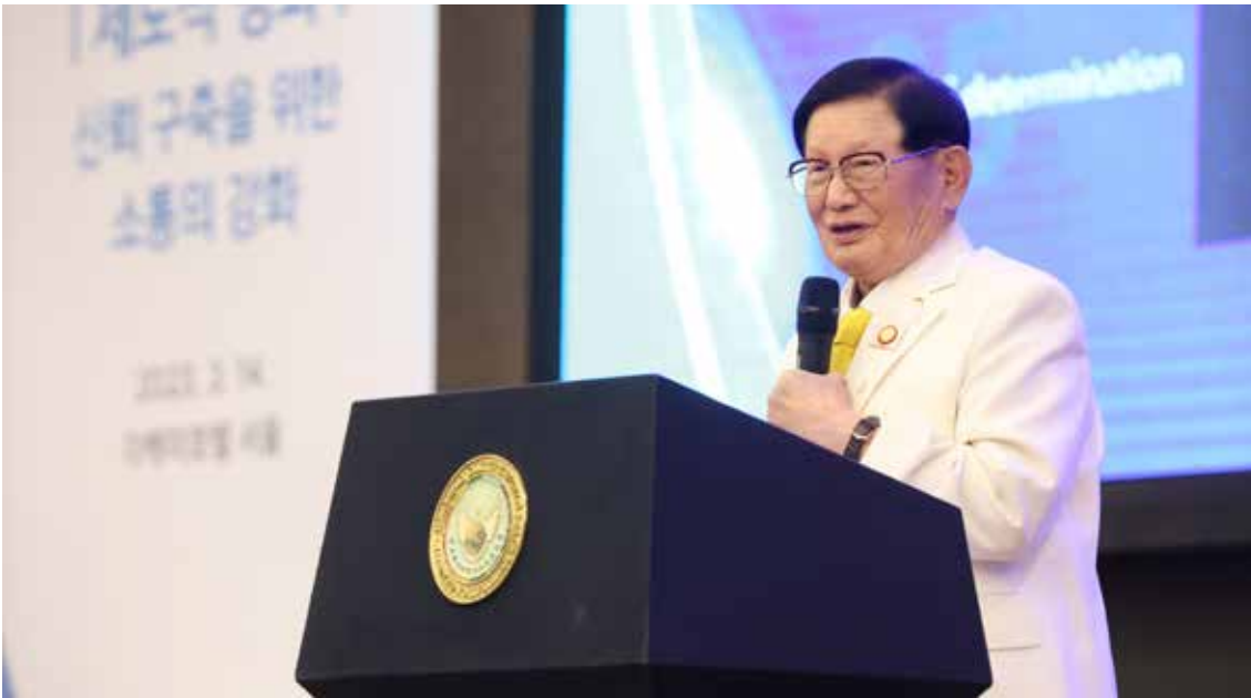
Lee Man-hee HWPL Chairman