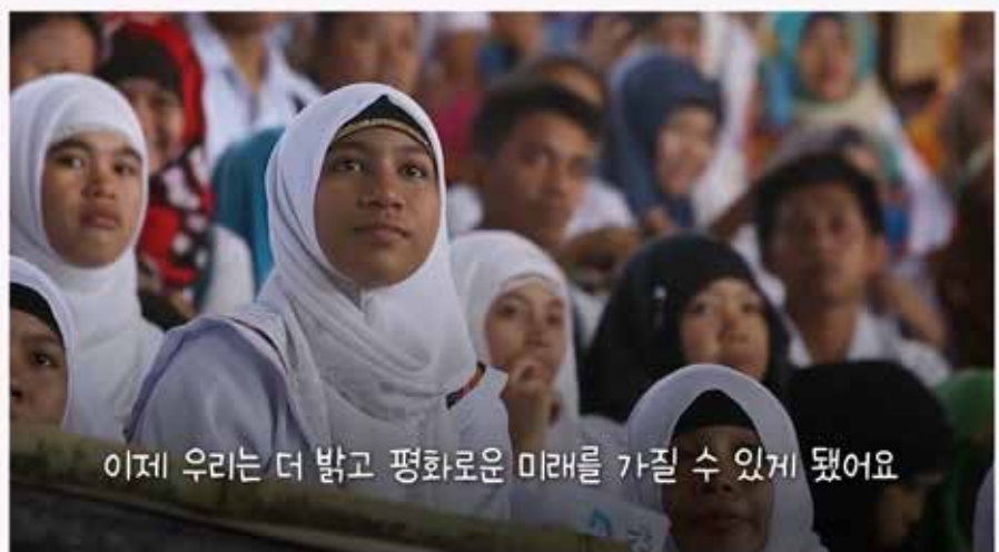
이제 우리는 더 밝고 평화로운 미래를 가질 수 있게 됐어요