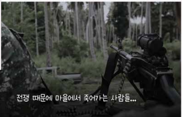
전쟁 때문에 마을에서 죽어가는 사람들...